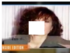
Leah Remini Makes Dramatic Exit From...