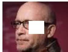
Gibney Takes on Scientology in New Doc